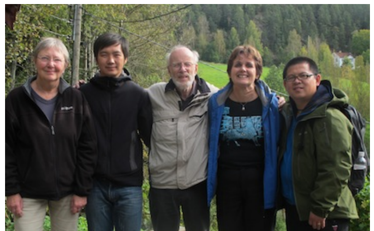
På tunet på Sagstua